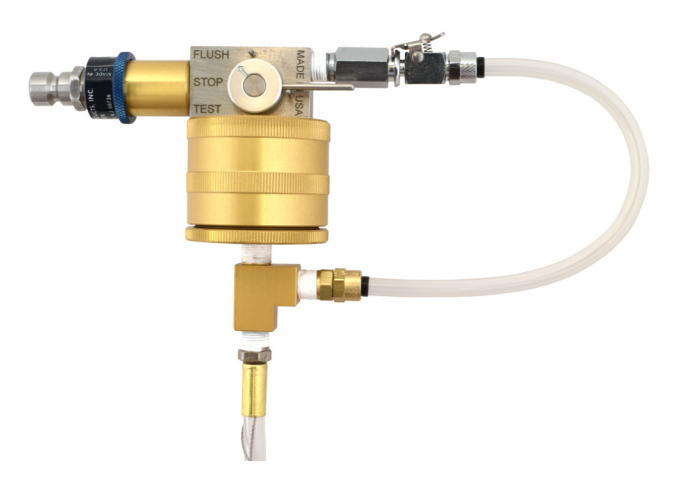
Model GTP-1172 Mark II shown