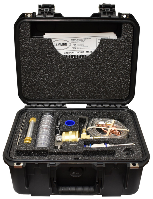
HOW TO ORDER

The new style of carrying case provides a cavity which accepts the assembled kit, eliminating the need to disassemble each time the apparatus is stored.